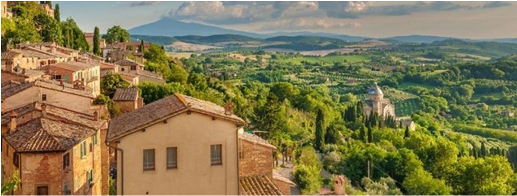
Our Tours of Tuscany

slender lanes and go to the CATHEDRAL with its San Brizio Chapel. Return to the “Eternal City” for a drive previous a few of Rome’s primary highlights, and a farewell dinner with operatic entertainment at Tanagra restaurant to have fun your journey to Umbria and Tuscany. The title of this Italy tour—Gems of Umbria & Tuscany—says it all, as you’ll visit some of the medieval hill towns and see some of the beautiful gems that call central Italy home. You’ll begin and end in Rome, and in between you’ll in a single day in Spoleto, San Martino in Campo, Siena, and Orvieto.