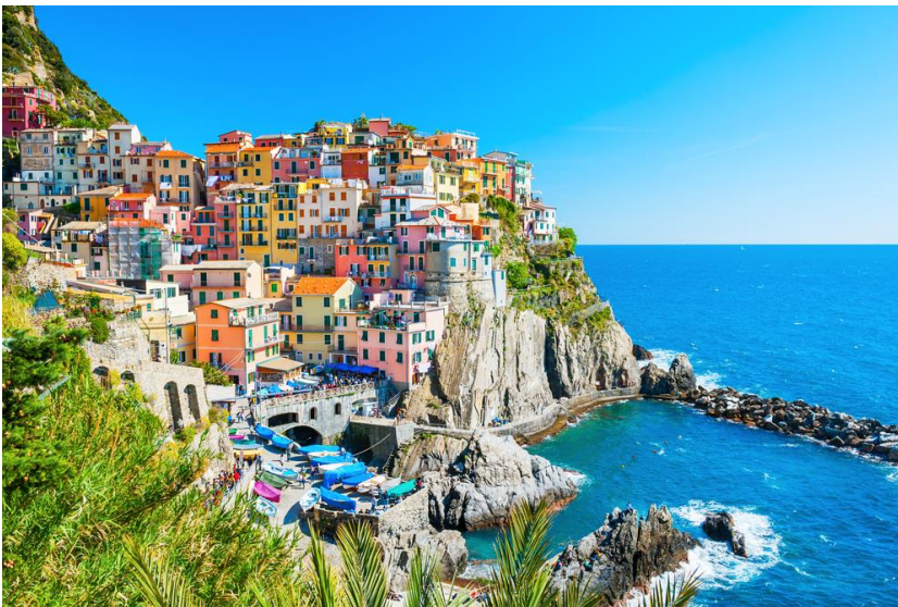
Pisa, Siena and San Gimignano Day Trip from Florence Including Lunch

Discover the Tuscan delicacies with considered one of our gourmand excursions or cooking classes. Explore the charming towns and medieval villages whilst having fun with genuine and scrumptious food and wine. Sample fine wines in the Chianti area, visit a cheese producer in Pienza or head to Montalcino, a hilltop town identified for its Brunello di Montalcino, one of the best red wines on the planet. Explore hidden gems and take the off-the-crushed path with our biking or walking tours. Choose from the personal Tuscany excursions provided by ToursByLocals, and feel free to suggest different locations and actions that you would get pleasure from.