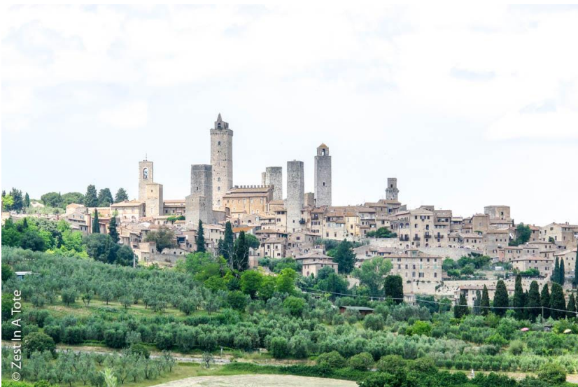
Culture of Tuscan Wine & Cuisine Tour

Perhaps the best place to visit in Siena is its excellent cathedral, one of Italy's biggest. Built from black and white marble it has some of the most intricate carvings possible, some of which are by the good grasp himself, Michelangelo. The ground is a revelation, laid with numerous thousands of interlocking stones, creating a singular inlaid surface at which, one can solely marvel at the sheer ability of its creators. Impressive as it is right now, had a planned additional nave been accomplished through the 14th century, it would have created the most important church in Christendom.