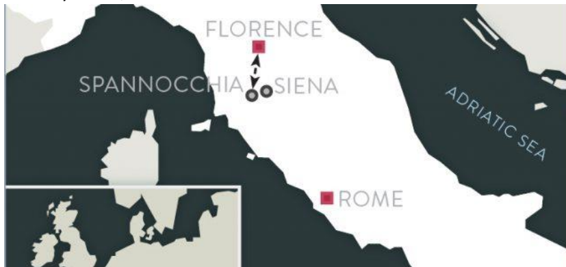
Tuscany Tours, Tickets & Activities

“like having English talking pals in Florence”. After lunch we visit the enchanting hilltop town of San Gimignano where you have free time to roam the picturesque streets and squares, browse the local retailers, attempt an award-profitable gelato and walk among the many town's well-known medieval towers. Discover Tuscany's rolling hills and delicious wines.